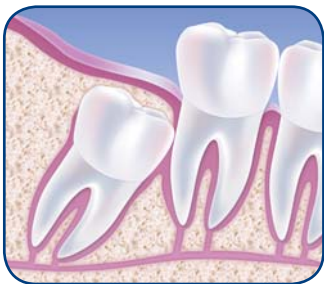
Angular, bony impaction of third molar (wisdom tooth).

Often times, wisdom teeth become trapped or impacted in the jawbone or simply fail to erupt. This can cause crowding or displacement of other teeth or lead to the development of localized tooth decay, infection, or gum disease. Impacted wisdom teeth are set in the jawbone in unusual positions, sometimes horizontally, which stops them from erupting in a normal way.